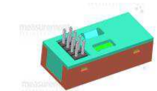
Energy Management Humidity