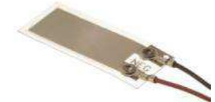
Vibration Sensing Piezo Film